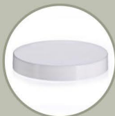
SMOOTH TOP SMOOTH SIDE