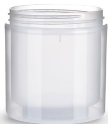
Straight Base | Polypropylene 9 Available Sizes