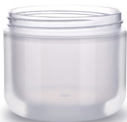
Dome Base | Polypropylene 9 Available Sizes