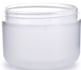
Frosted Dome Base | Polypropylene

2oz-58 | 4oz-70 | 4oz-89 | 8oz-89 | 10oz-89