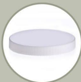
SMOOTH TOP RIBBED SIDE