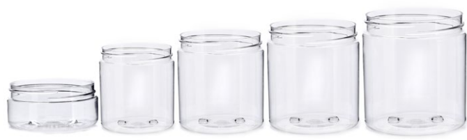
PET Regular | Polyethylene Terephthalate 8 Available Sizes