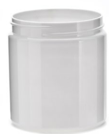
6 Available Stock Colors