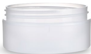
Frosted Straight Base | Polypropylene