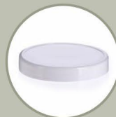
RECESSED TOP SMOOTH SIDE